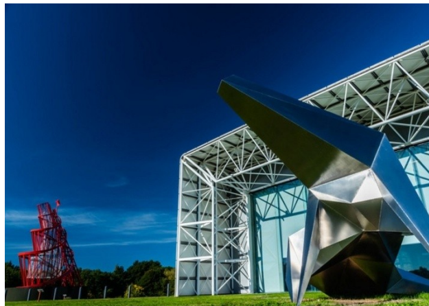
The Sainsbury Centre and two sculptures on the Sculpture Trail

Participants may wish to pop into Norwich city centre with its two cathedrals, excellent shops and market, castle, museums and a multitude of medieval churches.