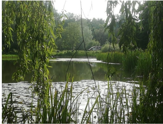
The Broad and Bridge

You may also see the famous 'ziggurats', some of the original student accommodation designed by Denys Lasdun in the 1960s.